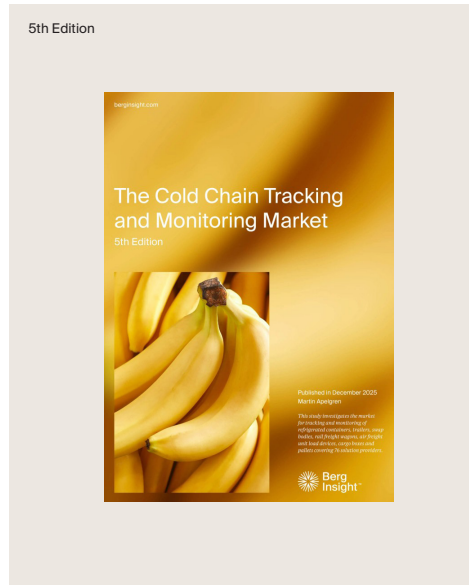
CATEGORY Transport & Logistics