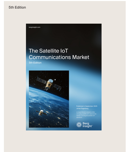
CATEGORY Horizontal Themes