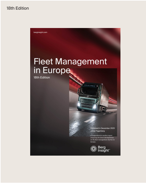
CATEGORY Transport & Logistics