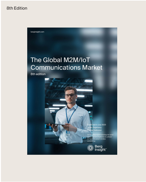
CATEGORY Horizontal Themes

Berg Insight AB Viktoriagatan 3 411 25 Gothenburg Sweden