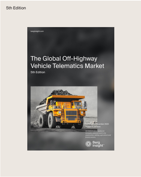
CATEGORY Transport & Logistics