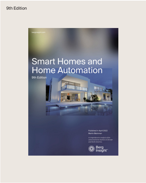
CATEGORY Smart Buildings