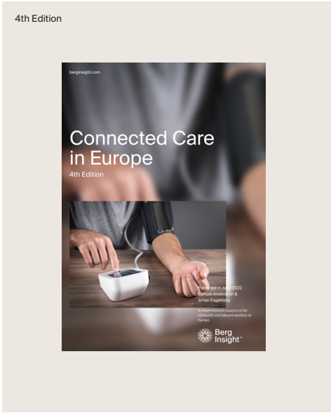
CATEGORY Connected Healthcare

Berg Insight AB Viktoriagatan 3 411 25 Gothenburg Sweden